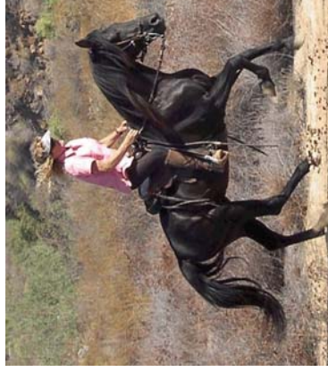
Ninja de Sao Joaquim, imported Brazilian stallion, CA

The Marchador is a working breed, used for ranch and cattle work on a daily basis in Brazil. It is known for its hardiness, soundness, and facility to learn and perform. They made history in the Guinness book of World Records for the longest horse trip, over 8,500 miles. The same horses rode every day from the Ocean to the Andes and back on a trip lasting over a year.