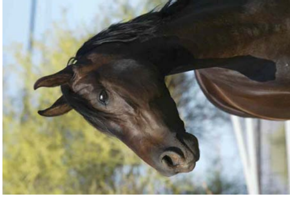
Bossa Nova de Miami, Marchador mare, AZ

Come meet the Marchador and share our passion!