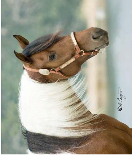
Tapixaba do Vale Vermelho, pinto mare, MT.